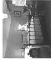
Granville Street Waterford Bally House Temple Bar Marlboro Bar, Dublin Interior Pembroke St. Cressna Binn, Malahide Ballymore Hotel Dublin Cressna Lodge Roskilde

93 Rathgar Rd. Rathgar. Dublin 6 Ph. 087 2466695